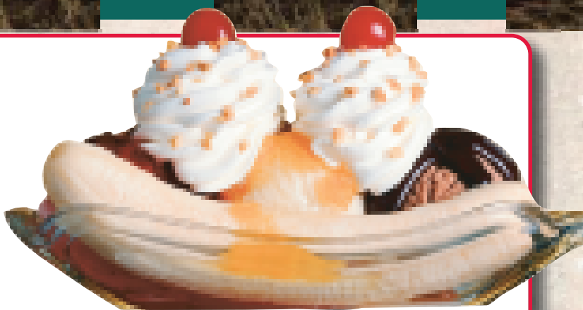
ROYAL BANANA SPLIT 8.35 ripe banana with three generous scoops of ice cream with fruit toppings, nuts & whipped cream, topped with a maraschino cherry

a gracious ice cream soda, any flavor, two large scoops of your favorite ice cream overflowing in any soda topped off with whipped cream